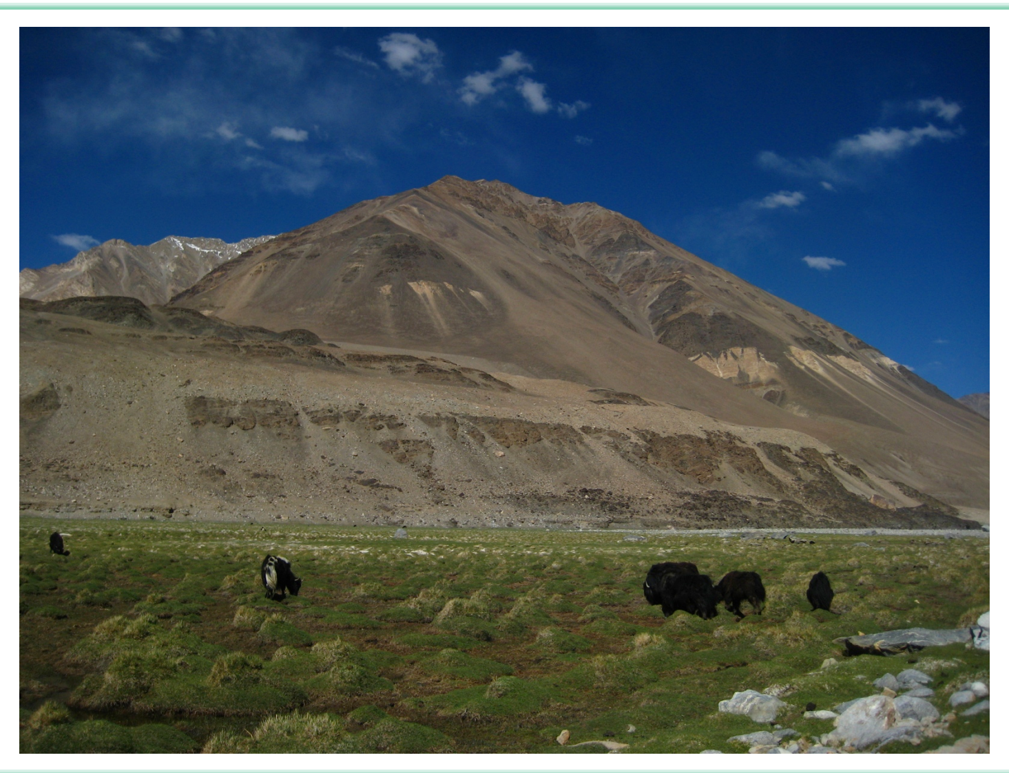
What is it? 10th edition of the annual CWH group trip to the land of passes. 3^{rd} - 11^{th} June 2017.

What would you call a journey traversing 3 of the 5 highest motorable passes in the world, the second highest salt water lake in the world, the second coldest inhabited place in the world, 3 entirely different terrains, 3 distinct cultures, 5 mountain ranges and possible for only 3 months in an year? Add an exploration along the remote Shyok river, monastery visits, hidden lakes, camping under the stars, glaciers, mountain biking, Tibetan cuisine, happening streets of Leh and you have a got a complete Ladakh experience for the first timer.