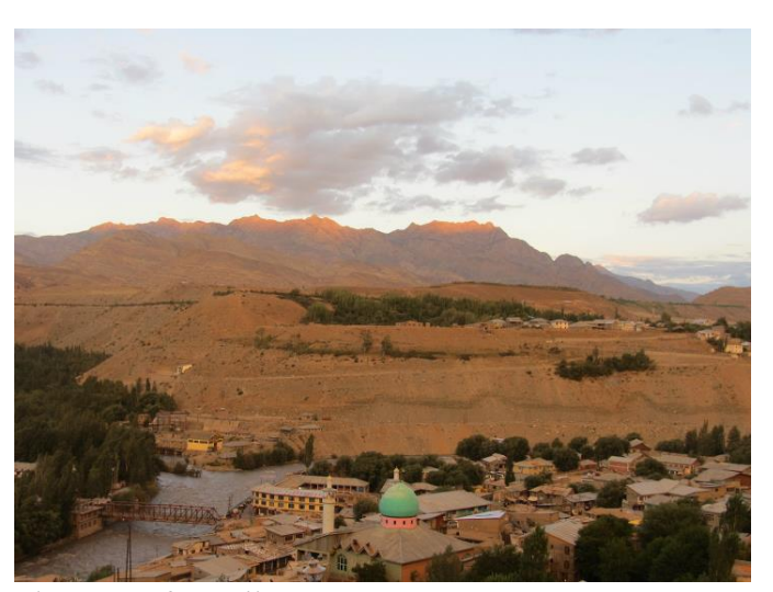
The town of Kargil