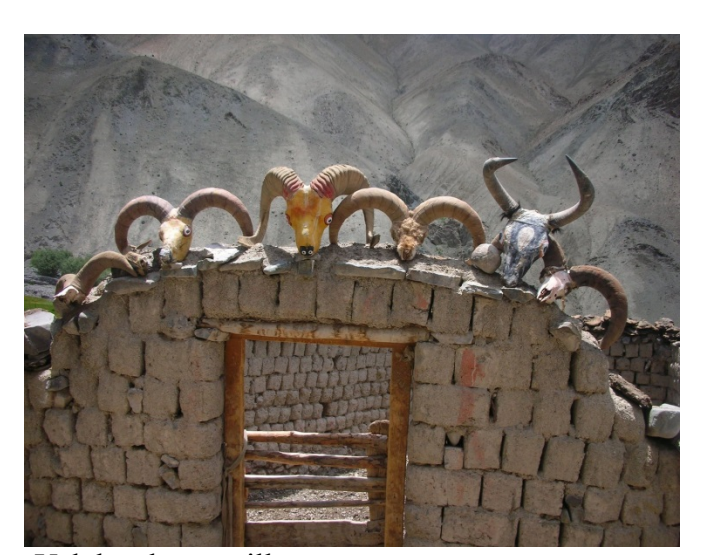
Yak heads at a village entrance