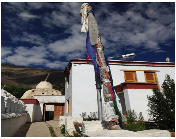
Alchi, a unique monastery in Ladakh