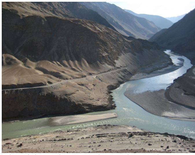
The mighty Indus meets the Zanskar at Nimmu