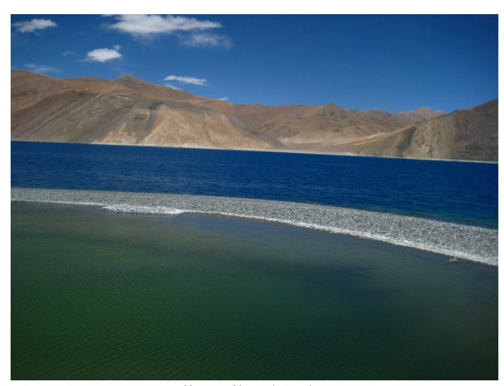
Pangong Tso at India- Tibet border

Mountain ranges: Ladakh range, Pangong range