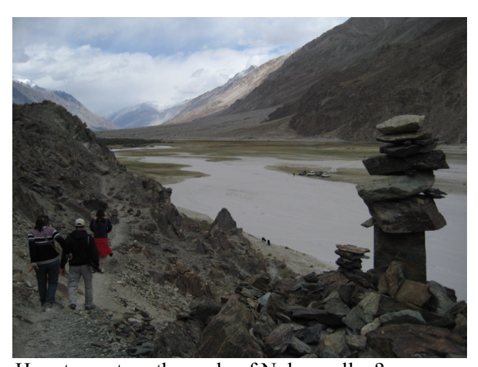
How to capture the scale of Nubra valley?