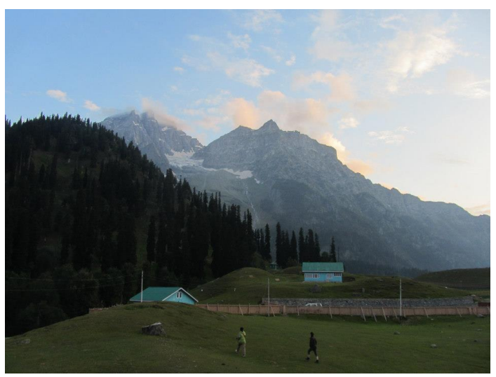
Sonmarg and the Thajiwas glacier

Mountain ranges: Pir Panjal, Greater Himalaya